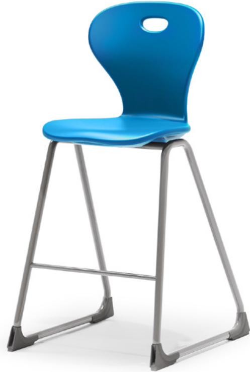
Oracle 28"H fixed-height stool shown in Midnight Blue