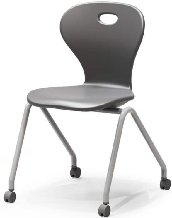
Oracle 18"H Mobile Chair shown in Graphite